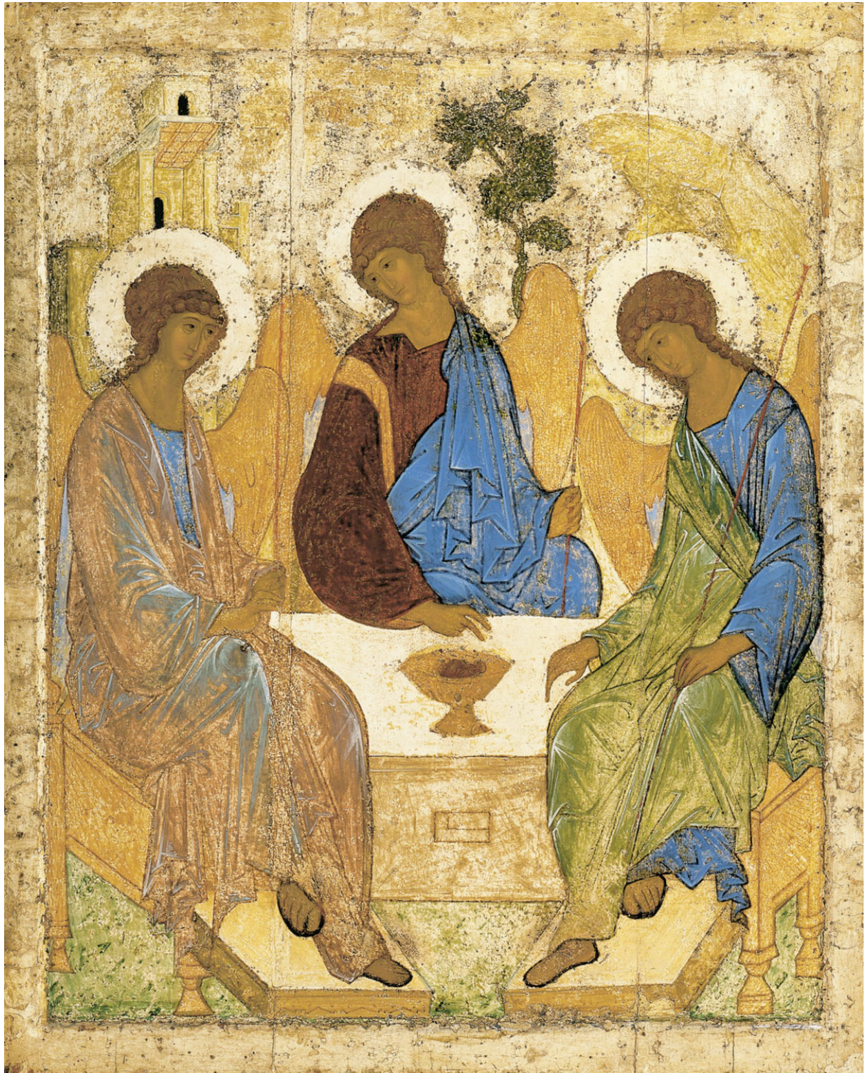
Trinity (Andrei Rublev)