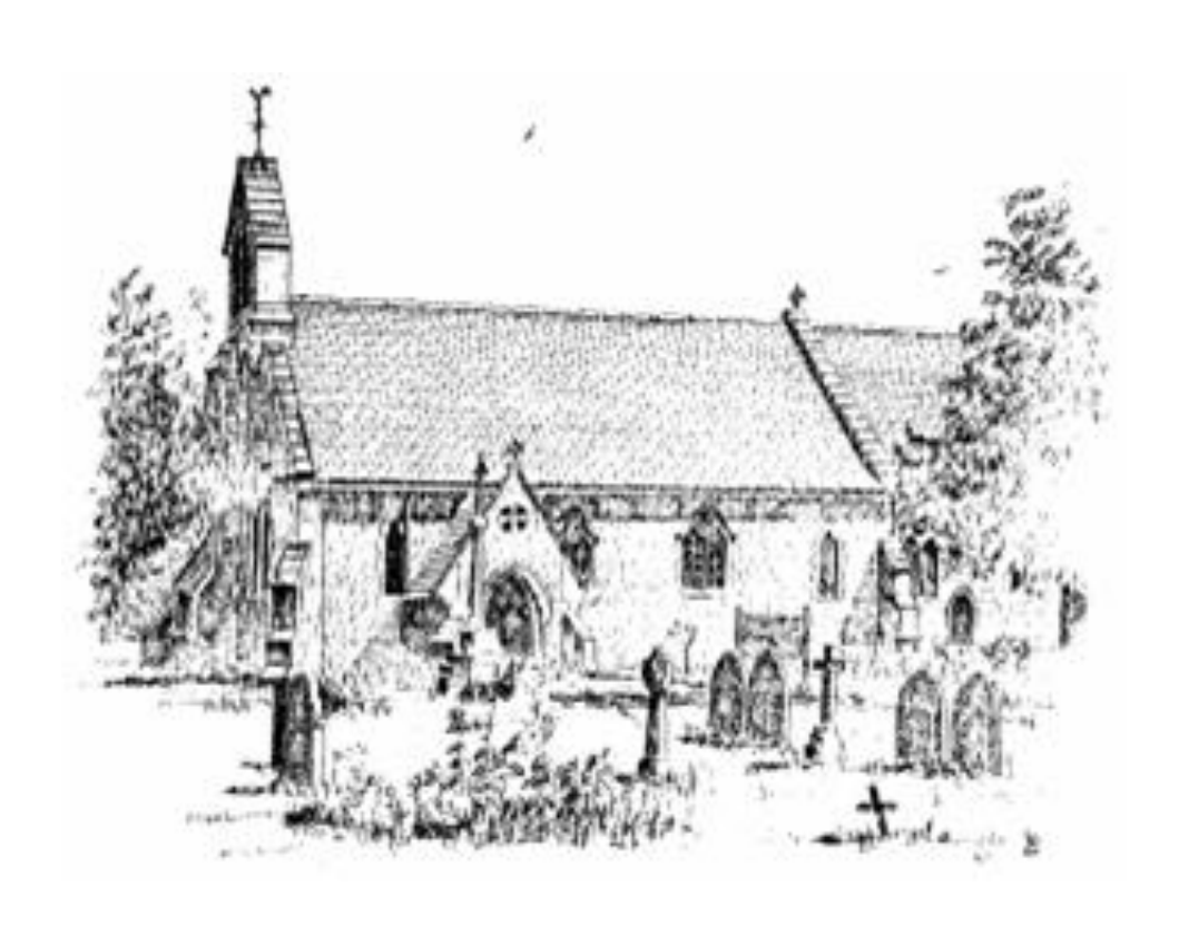
Thomas the Apostle 3<sup>rd</sup> July 2022