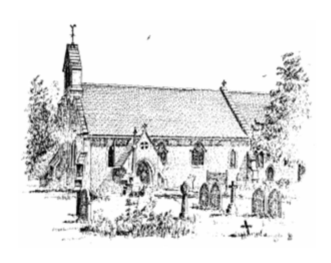
Sunday Next Before Lent 19<sup>th</sup> February 2023