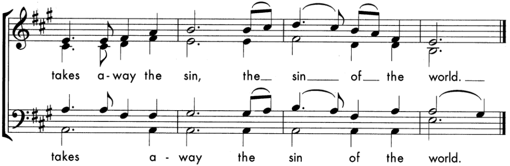
Giving of Communion

Alleluia. Christ our Passover is sacrificed for us. Therefore let us keep the feast. Alleluia.