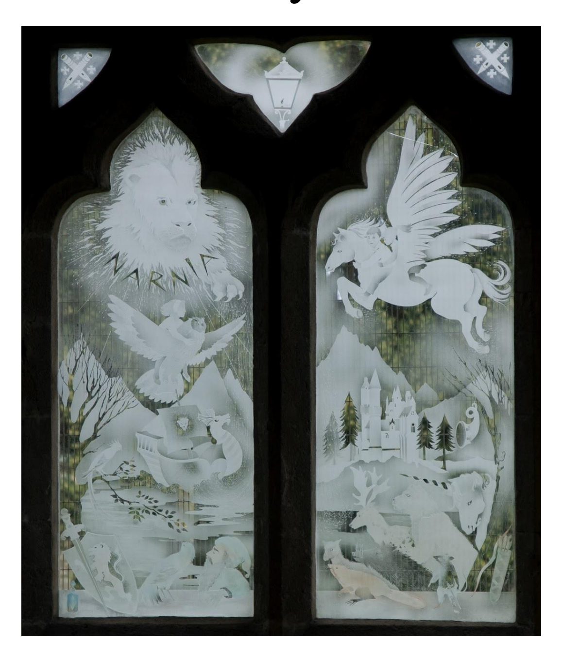
Sunday 24<sup>th</sup> March 2024