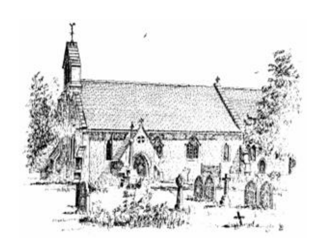
Sixth Sunday After Trinity

An open door between heaven and earth, showing God's love to all