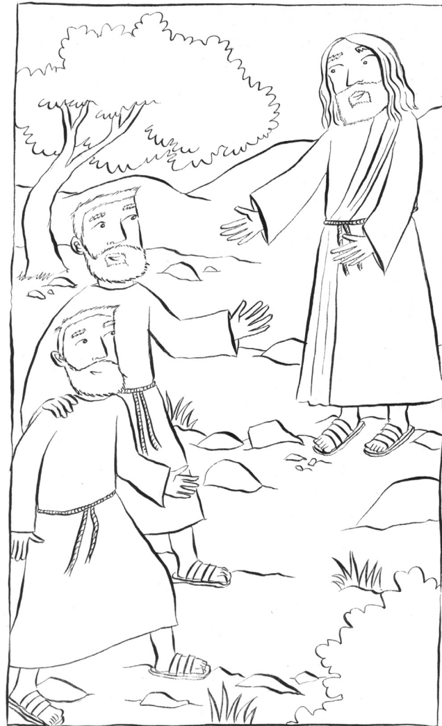
Philip brought Nathanael to, 'Come and see.'

Philip and Nathanael both have an unexpected encounter with Jesus.